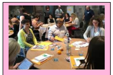
APs collaborating with colleagues at the national AP training events.