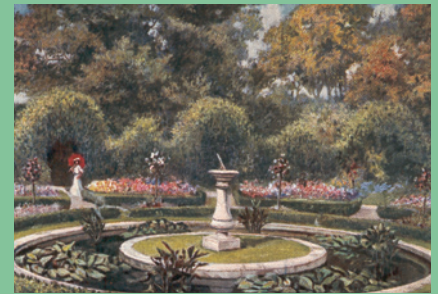
Italian Gardens 1905

Take the path to the left until you are next to the temple. Go behind the temple. Here is the Italian Garden. Cross the garden to the back wall. Turn right and you will be back at the main entrance of the park. Take the path to the left until you are next to the temple. Go behind the temple. Here is the Italian Garden. Cross the garden to the back wall. Turn right and you will be back at the main entrance of the park.