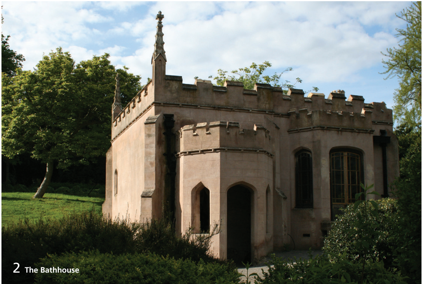
2 The Bathhouse