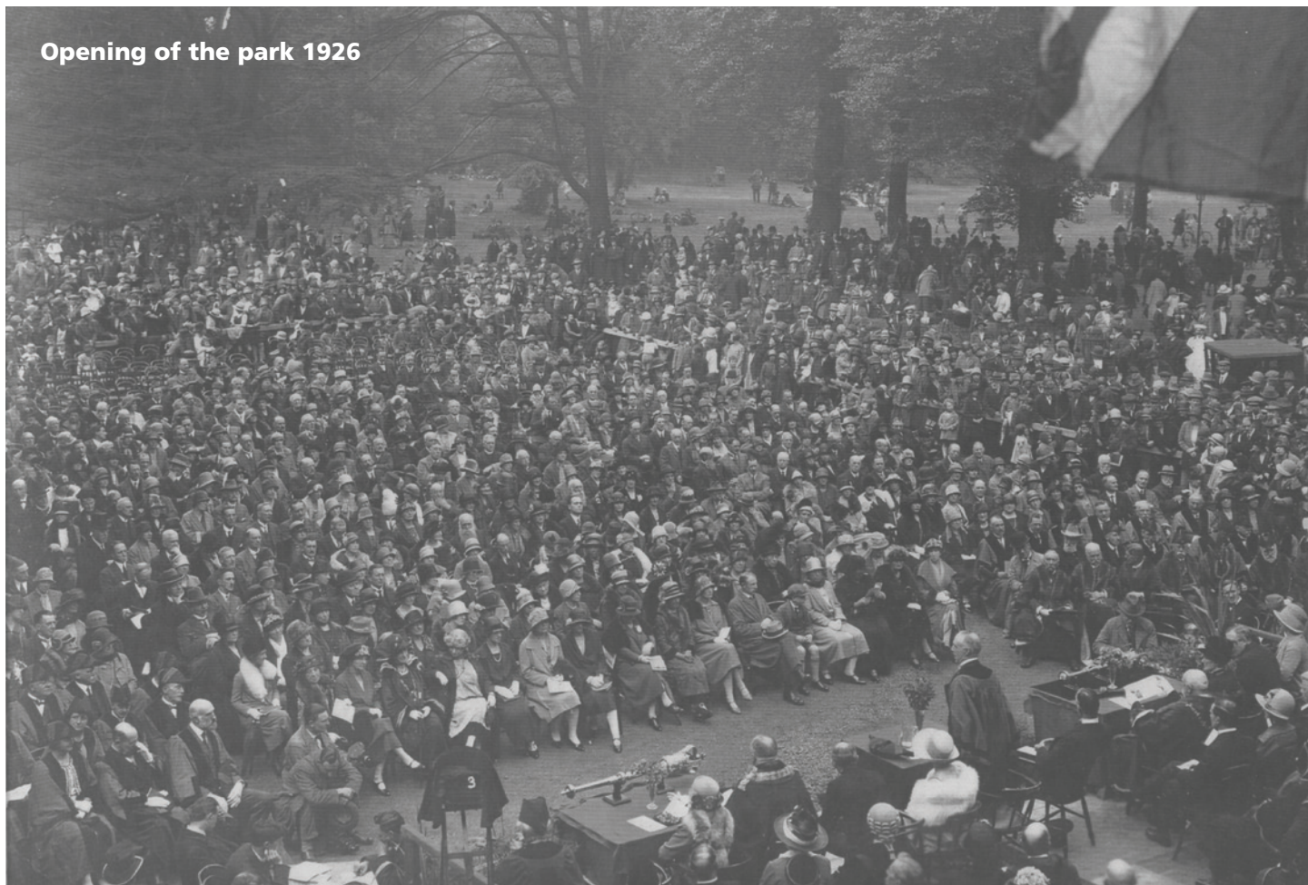
Opening of the park 1926