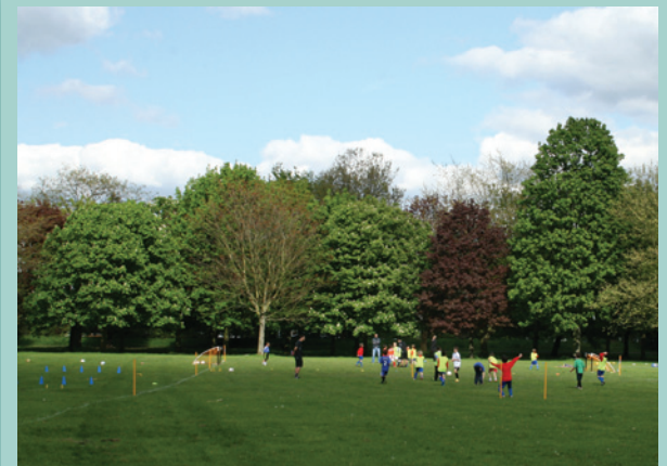
Games on the playing fields

Walk around the playground to the right. Follow the path until you see the temple and the pond in front of you. Stop here.