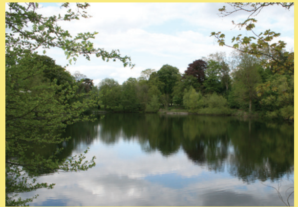
The Potomac Lake

Today the Potomac Tower is not in use because it is in very bad condition and you cannot go into the tower. Also, the lake is very deep and can be dangerous.