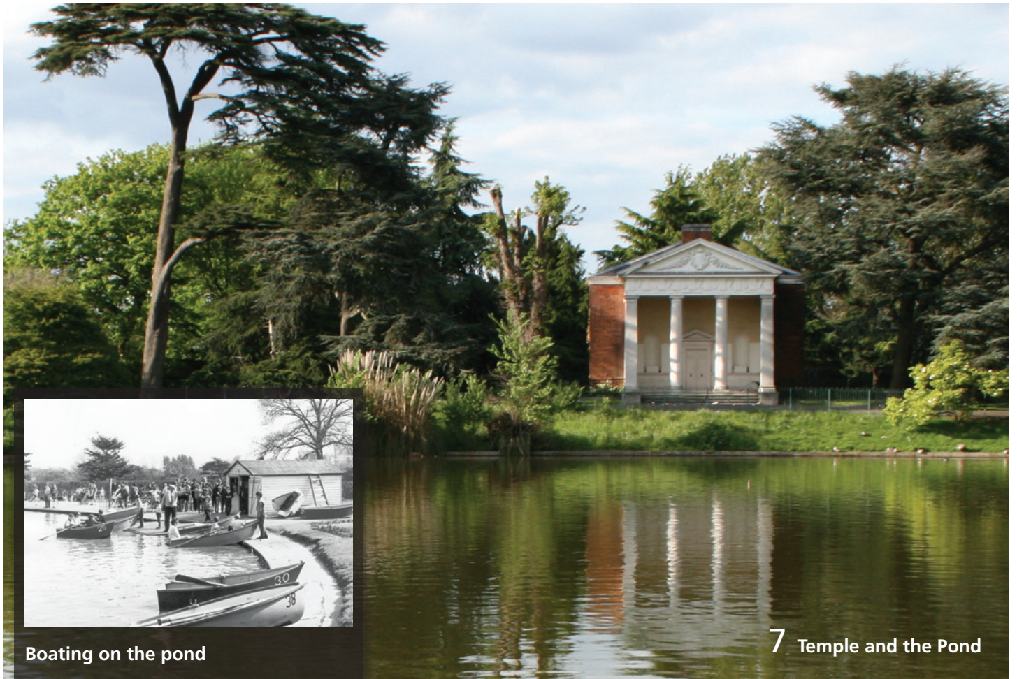
Boating on the pond