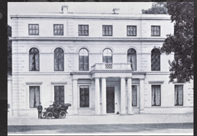
Gunnersbury Park House