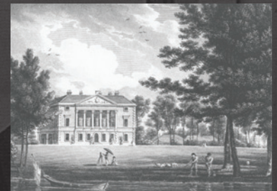
The Webb House