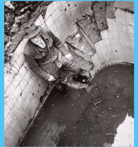
Man restoring the inside of bathhouse 1950