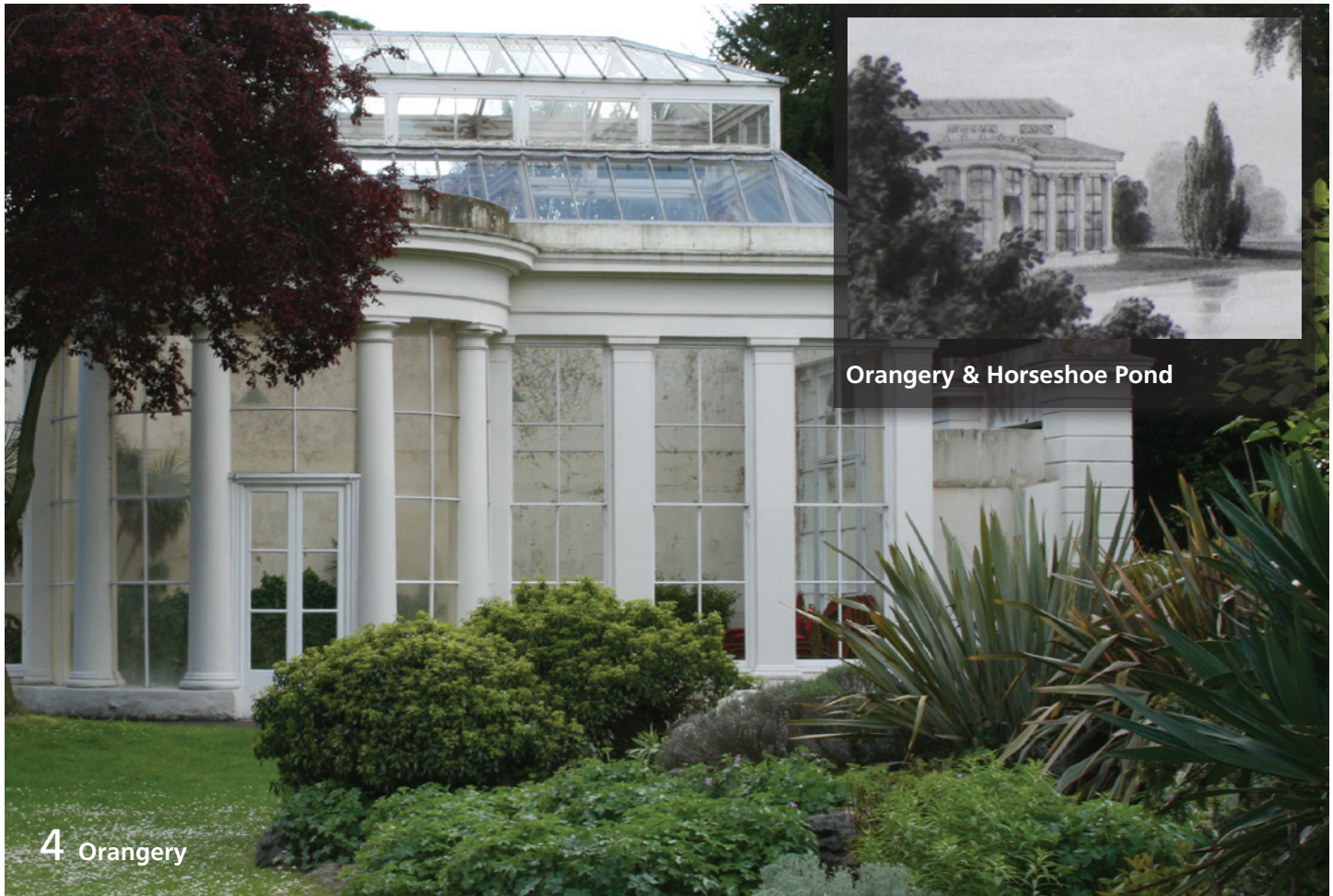
Orangery & Horseshoe Pond