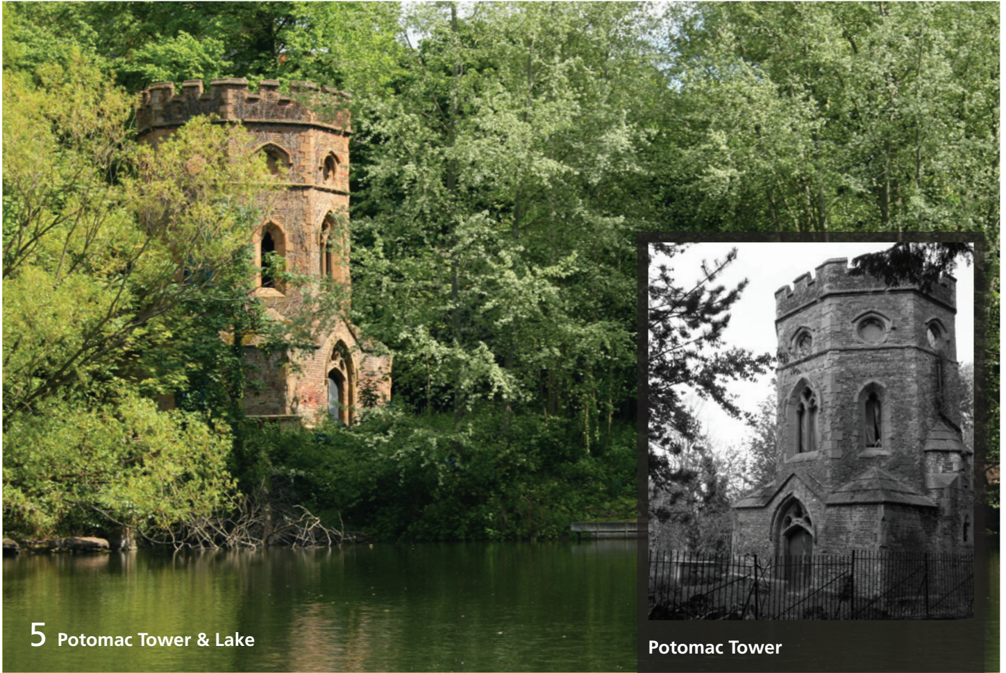
5 Potomac Tower & Lake