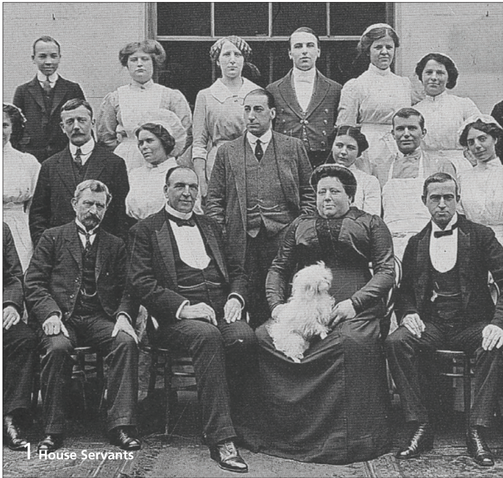
1 House Servants