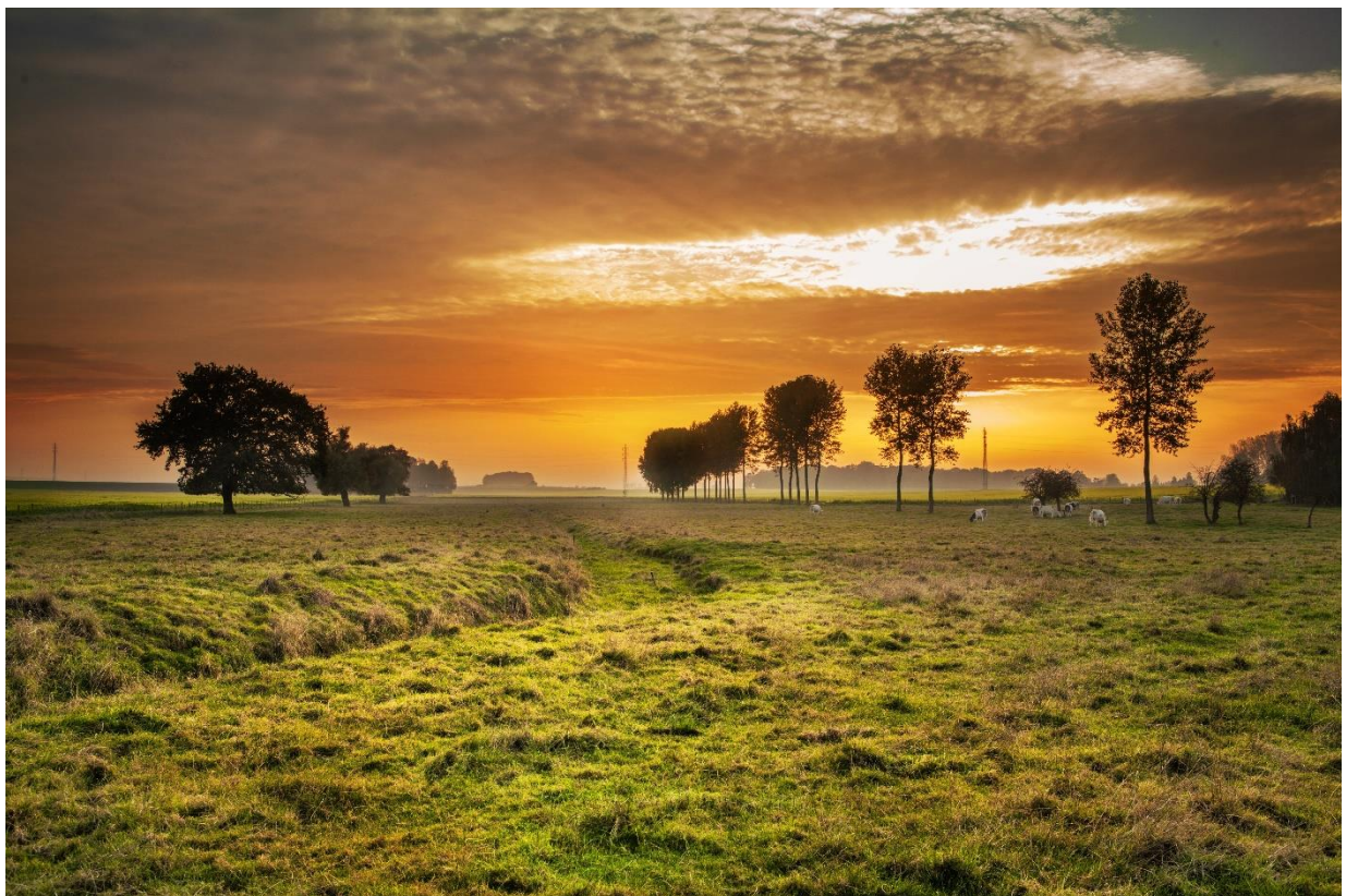
Landscape - Photo by Kenneth Thewissen on Unsplash