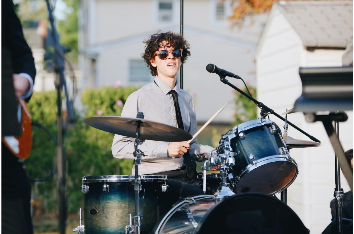
Live music