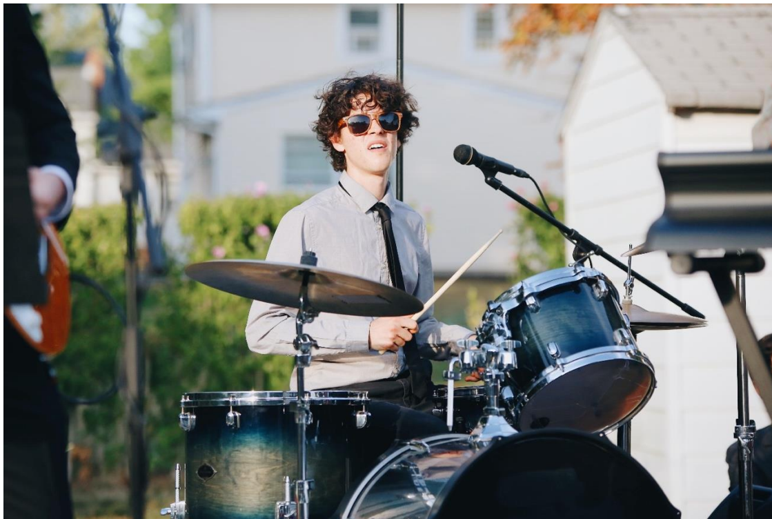
Live music

Things I like doing Resource 3.2.L1: Activities