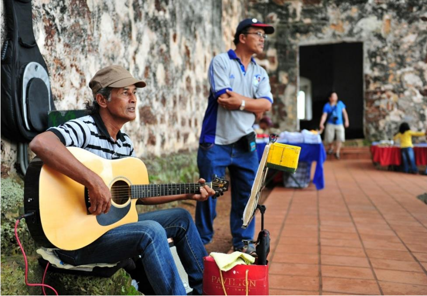
Playing guitar