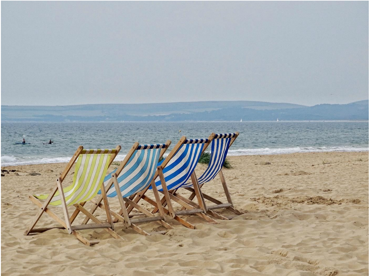
Beach /Seaside