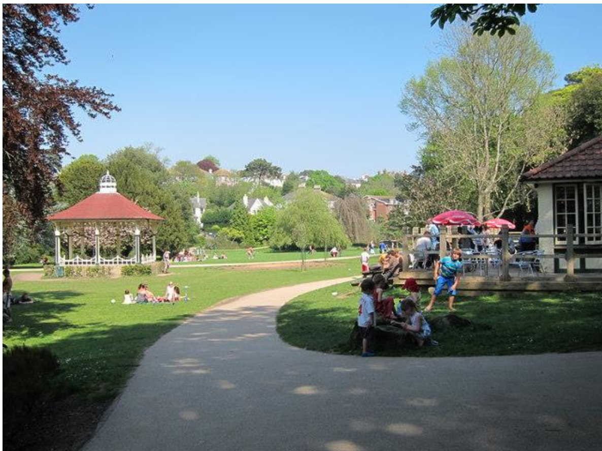
Alexandra Park, Hastings