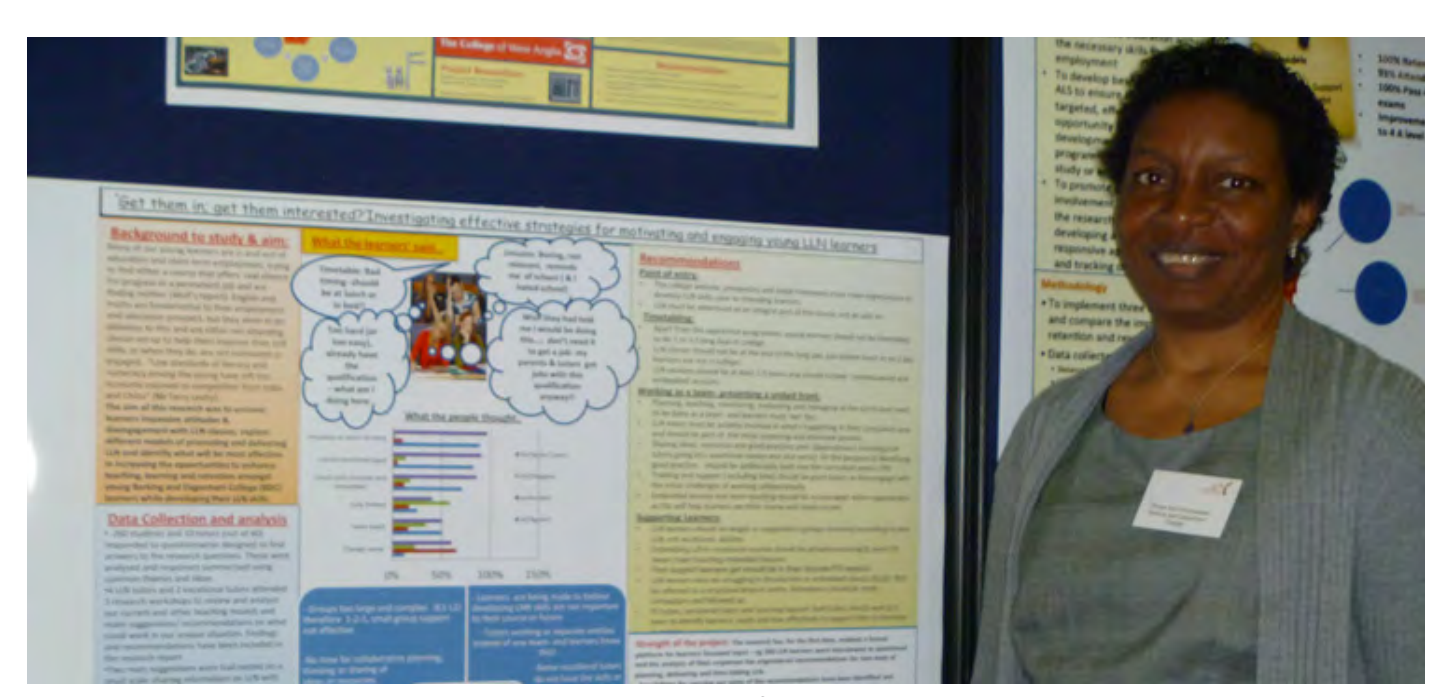
Tinyan presents her research poster at the LSIS 2012 research conference

If you are interested in applying for the next round of projects, starting in October 2012, please see page 4 for further details.