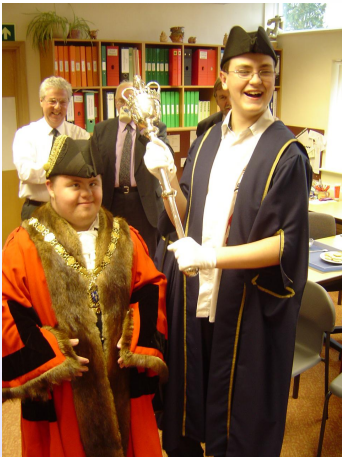
Political Literacy at the Vale of Evesham School

In PSHE lessons we were learning about the role of the NHS and the services it provides—the active citizenship element was our participation in a local campaign to challenge proposed changes to our local hospital.